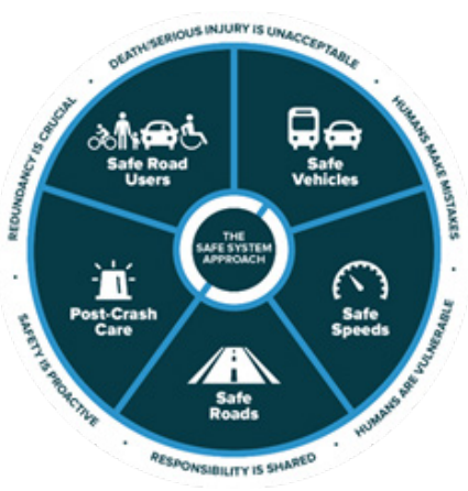
Figure 1 Safe System Approach

Caltrans' implementation of the Safe System Approach includes elevating and institutionalizing a safety culture. This includes